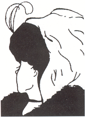
Hill, W.E. "My Wife and My Mother-in-Law."— Puck —16, 11, Nov. 1915

take the models offered by science for the realities themselves, just as the statue of Zeus can become mistaken for the god himself. Lord Kelvin, the nineteenth-century physicist, demanded a mechanical model before he would accept a theory of physics. Alfred North Whitehead termed this “the fallacy of misplaced concreteness.” The sign and statue are meant to point beyond themselves. Likewise analysis is meant to point beyond itself. The models are not the point, but rather they represent to us a hidden intelligibility of the world.